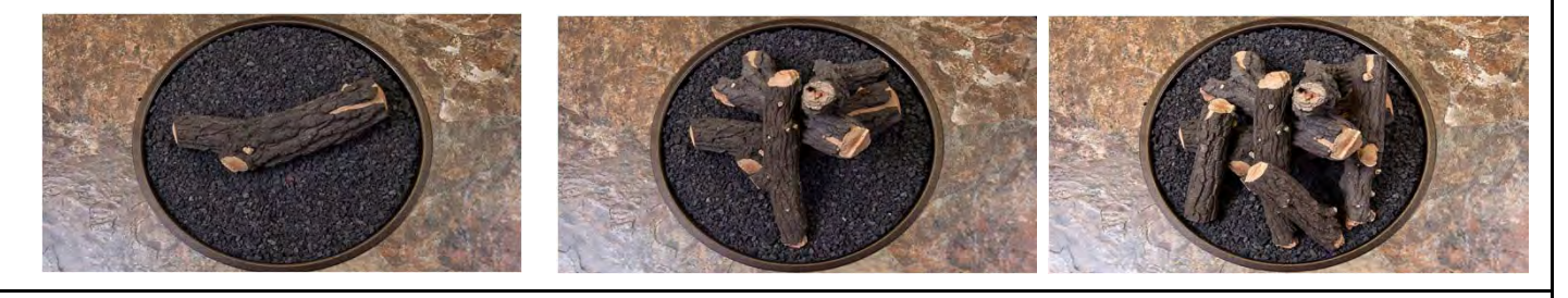
Figure 3. Place the balance of the logs as desired. Make sure to leave enough air flow.

(See Figure 1, 2 and 3) Figure 2. Place the larger three logs as desired using the largest log as the support.