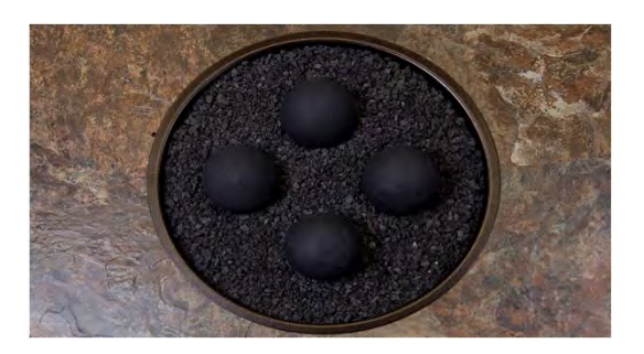
Figure 4. Add the smaller spheres as illustrated below

Figure 2. Place the larger spheres evenly over the edge of the burner