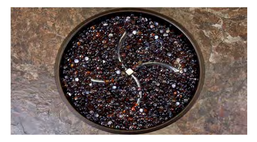
Figure 2. Pour the additional bags of media onto the burner support. Spread the media evenly covering the burner.

Figure 1. Pour the first bag of the glass media into the burner support.