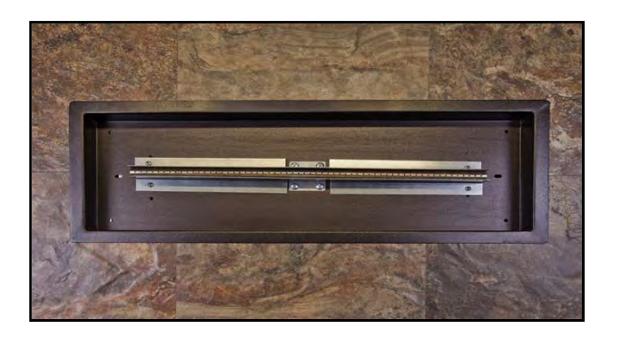
Figure 1. Rectangle Burner Support and Stainless Steel Burner