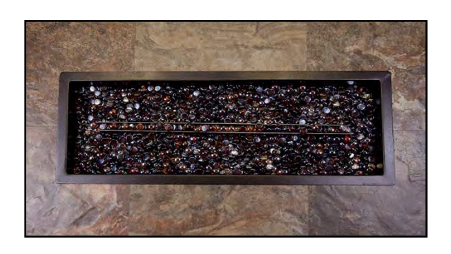
Figure 2. Pour the first bag of the glass media into the burner support.