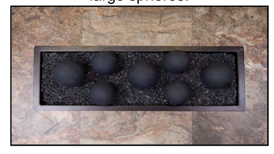
Figure 3 Add the medium spheres in between the 1st and 2nd large spheres.